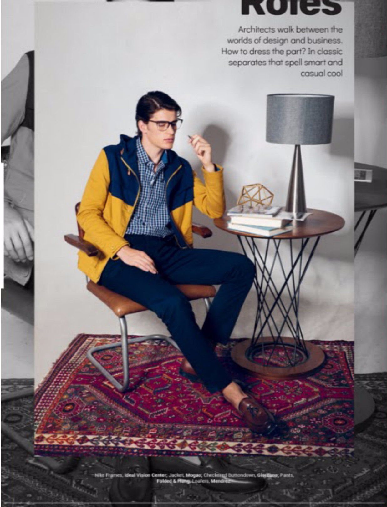
Nike Frames, Ideal Vision Center, Jacket, Mogas; Checkered Buttondown, Giorbas; Pants, Folded & Flung; Loafers, Mendrez

Architects walk between the worlds of design and business. How to dress the part? In classic separates that spell smart and casual cool