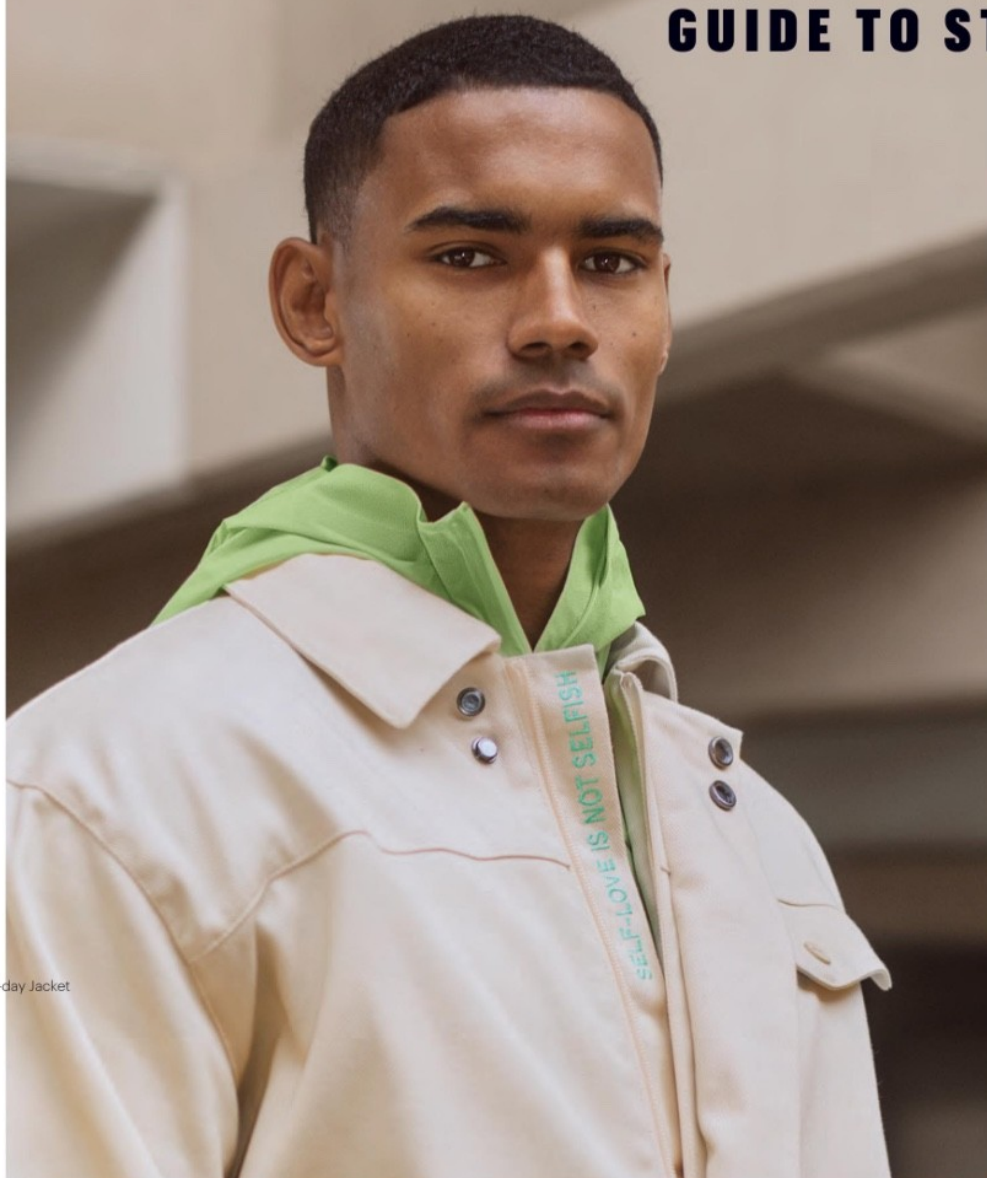
SELF-MADE adidas Originals V-day Jacket